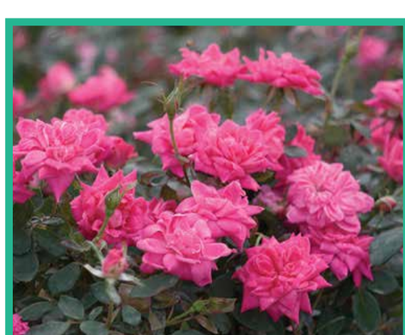
Giant, bright pink flowers