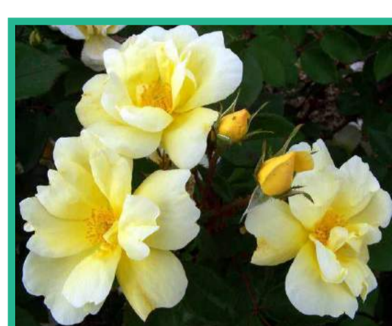
The only fragrant knock out